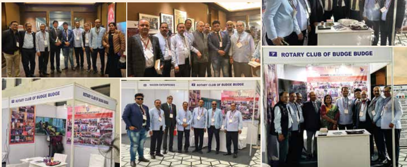
RCBB Stall at RI District Conference 3291, 2023-24 (with Past District Governors)